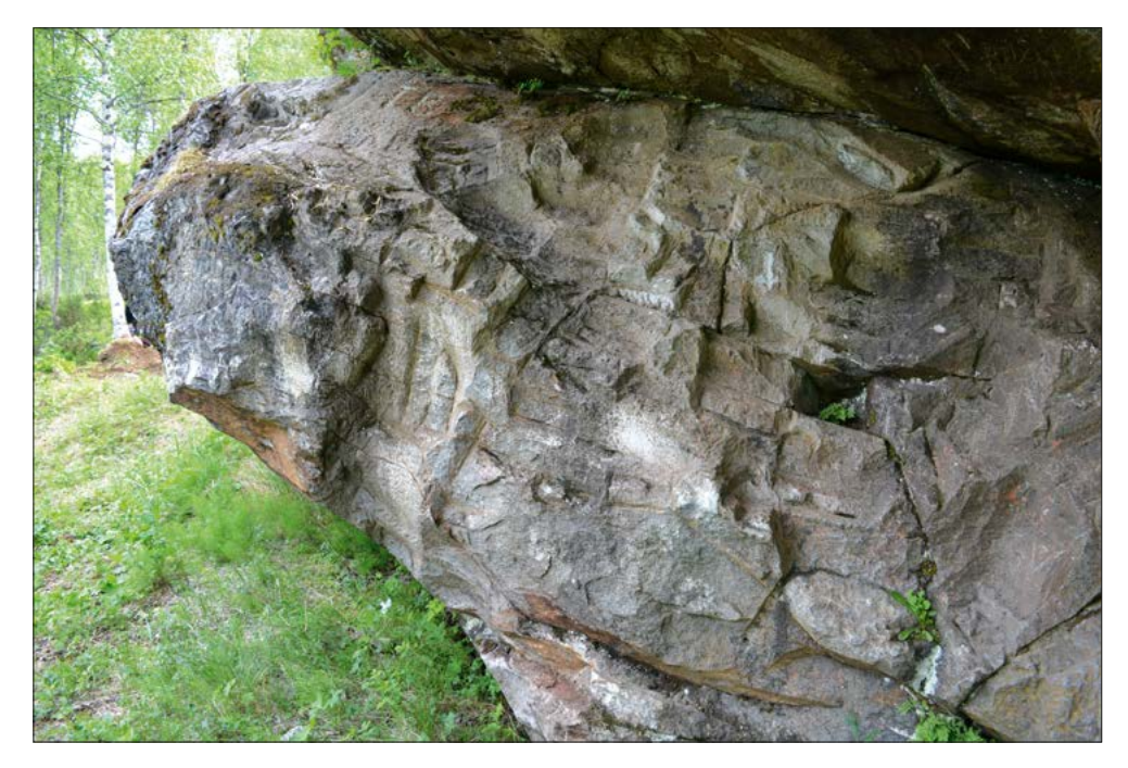
Fig. 2. Small extractions in a soapstone quarry at Talggrøtberget.