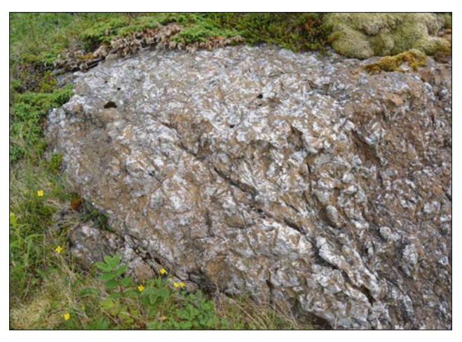
Fig. 6. Esjeholmen in Nordland.

(Lindahl & Nilsson 2002); owing to its characteristic, prominent shape, it is known as a landmark and a sieidi , a sacred place in the landscape worshipped in traditional Sámi religion as gateway to the spirit world.