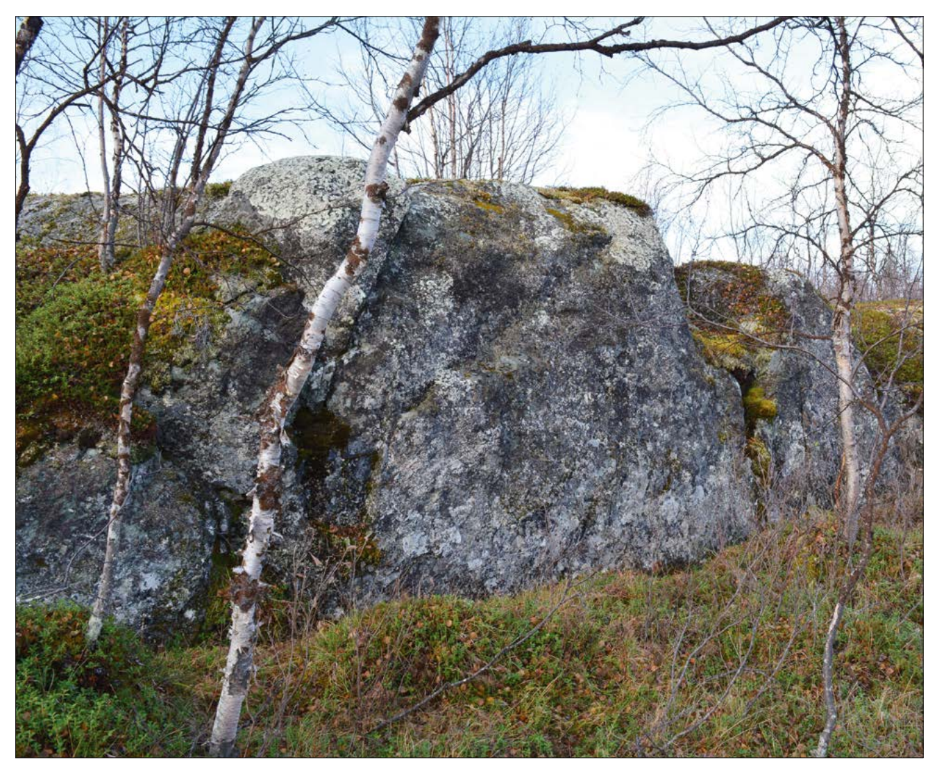
Fig. 4. The Assebakte soapstone deposit in Finnmark.

In 2013 and 2014, archaeological investigations were conducted at 11 deposits (Fig. 1) and extractions from previous production were documented at Stolpe and Hesjetuva in Nordland County, Kanebogen and Talggrøtberget in Troms County and Straumdalen in Finnmark County