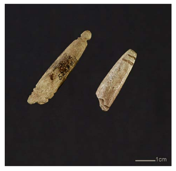
Fig. 3. Fishing jigs from Noatun, Pasvik Valley, Finnmark.

soapstone deposits with traces of possible early use, though the exact number of utilised deposits is difficult to estimate. Although the MSD lists all known soapstone deposits in Norway, the CHD only contains deposits that show traces of prehistoric or historic use. The majority of sites mentioned in the CHD are listed in the MSD , but the CHD also includes a few sites that are not recorded in the MSD . These are primarily sites that cannot be classified geologically as soapstone, but which were quarried and used for the same purposes as soapstone or have a vernacular name related to soapstone. This in itself exemplifies a possible tension or incongruence between science-based classification and emic categories based on local skills and knowledge.