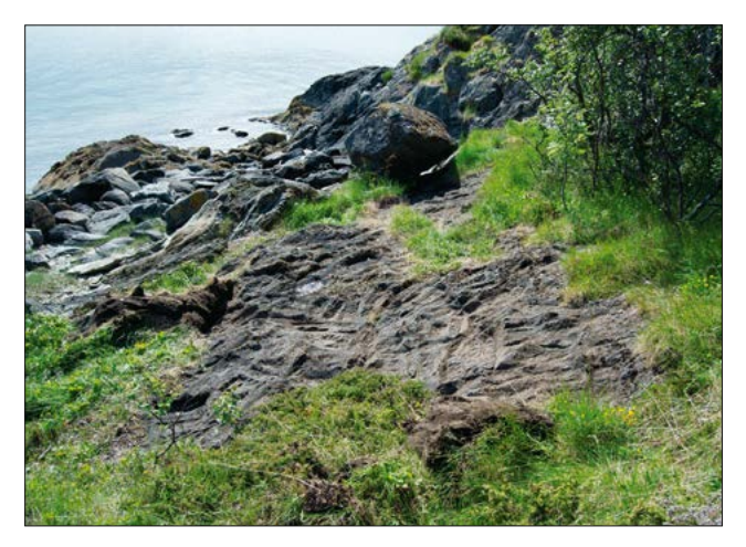
Fig. 5. Small rectangular extractions at Kanebogen.

Some deposits might have been more than a source of raw material. The name of the Assebakte deposit in Finnmark derives from the Sámi word Ássebákti, which means "soapstone" or "soft rock that is easy to carve" (Nielsen & Nesheim 1962:5). The deposit consists of a long knoll, approximately 5 m high and 15 m long, which is clearly silhouetted against the slightly undulating landscape (Fig. 4). The name Assebakte is also applied to the surrounding area, which is strewn with scattered boulders; as is common with Sámi place names, Assebakte seems to refer to prominent features in the landscape. Sámi place names give information about, for example, the topography of the area, weather specific to the area or its reindeer pasture and often function as "orientation guides". At Assebakte, a track passing close to the deposit and several nearby fireplaces give the impression that the site was a natural place for a rest. The path and fireplaces seem to have been used recently for reindeer herding, but may also have been used further back in time. In the vicinity, there is also an investigated settlement site dated to the Viking Age and Early Medieval Period, though without finds of any soapstone artefacts (Simonsen 1979). The Stabben deposit in Troms appears to have had a similar function